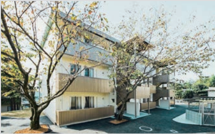
International House Bldg. C

© Support for Japanese Language and Culture Various levels of Japanese language classes are offered so that international students can choose those which match their Japanese proficiency. The university also offers Japanese history and culture programs and field trips.