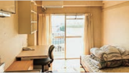
International House Single Room

© Food 30,000 - 45,000 yen © Accommodations < International House > Single Rooms 17,000 yen (incl. common service charge) < Private apartments > 25,000 - 60,000 yen © Total Average Monthly Living Expenses 80,000yen -