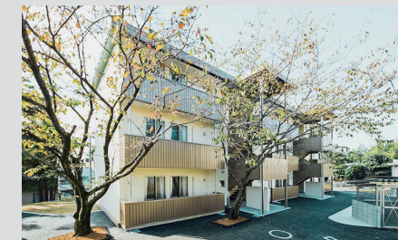
International House Bldg. C

Various levels of Japanese language classes are offered so that international students can choose one that matches their Japanese proficiency. The university also offers Japanese history and culture programs and field trips.