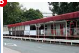
Tokaigakuen-mae Train Station