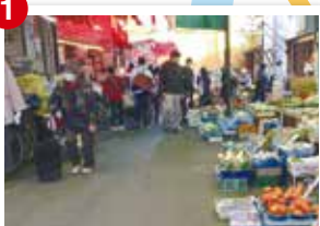
Kokai Market Street