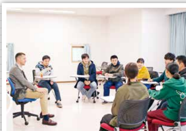
イングリッシュ・トークモン (課外活動) "english TALK-mon" (Extracurricular Activity)