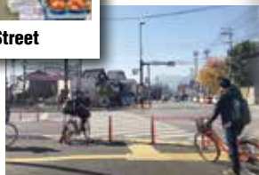
Kokai Market Street