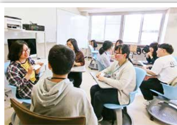
日本語ラーニング・コモンズ (課外活動) "Learning Commons" in Japanese (Extracurricular Activity)

Student cannot take the same class twice. 同じ授業科目を2回履修することはできません。