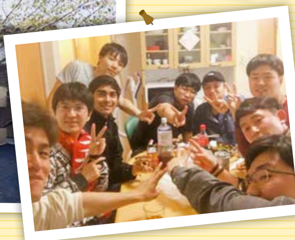
Student Dormitory, International House