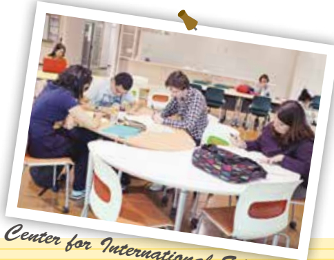
Center for International Education