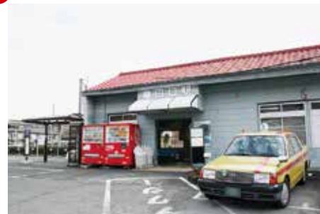
Tatsudaguchi Train Station