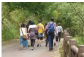
Tatsuda Nature Park