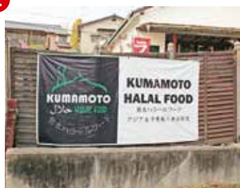
Halal Food Shop