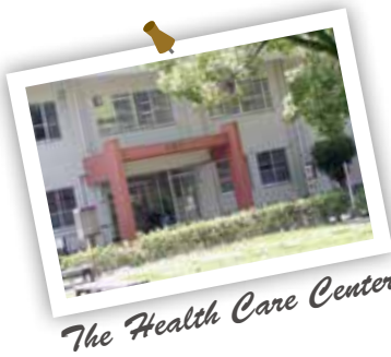
The Health Care Center