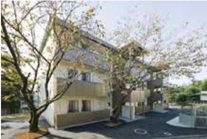
International House Bldg. C

Various levels of Japanese language classes are offered so that international students can choose one that matches their Japanese proficiency. The university also offers Japanese history and culture programs and field trips.