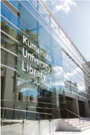
Kumamoto University Library