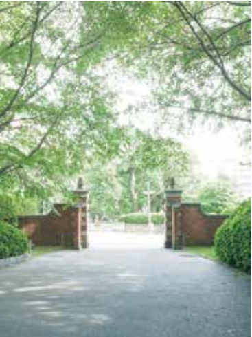
The Front Gate (The Red Gate)