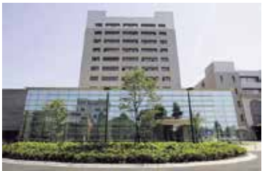
100th Anniversary Hall