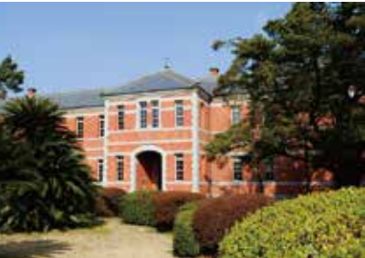
The Memorial Museum of the Fifth High School

1850~1904 A British national born in Greece. In 1891, he took up his new post at the Fifth High School. His work "Ghost Stories" ("Kwaidan") introduced Japan's mysterious traditions in English, and is widely known. He wrote many books while he was in Kumamoto.