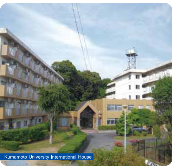
Kumamoto University International House

Many students from abroad initially stay at Kumamoto University's international student dormitory, a place for these students to meet and exchange information. The many student-oriented apartments around the University further make residence easy to secure for students.