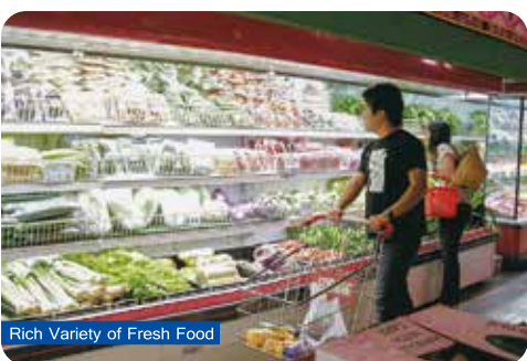
Rich Variety of Fresh Food

Blessed with pure waters and varied landscapes, Kumamoto is one of Japan's leading agricultural prefectures and is renowned for the diversity of the agriculture, forestry and fishery products harvested locally. Local supermarkets offer a wealth of ingredients, yet at student-pleasing prices that are low compared to other prefectures.