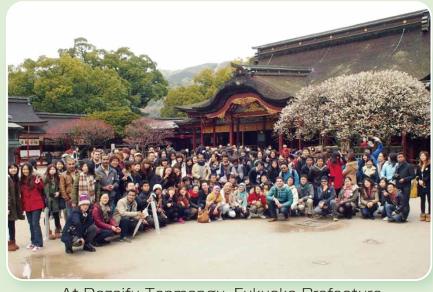
At Dazaifu Tenmangu, Fukuoka Prefecture

The field trip gave international students enrolled at our university the opportunity to deepen their understanding of Japan and its history, culture, science and technology. It also provided them with the chance to make friends with international students from other departments, whom they would not normally meet in everyday life. A number of participants even stated that they are already looking forward to the next field trip.