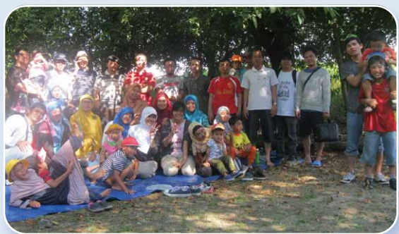
Meet and greet with Indonesian students at Kumamoto University

the KU Liaison office was established at Institut Teknologi Sepuluh Nopember (ITS) Surabaya, Indonesia. The liaison office of KU at ITS is expected to strengthen the research collaboration and student exchange between Kumamoto University and ITS, consortium partner universities and other leading universities of Indonesia. Another purpose is to assist the networking of alumni who are living in Indonesia. My expectation is to turn KU Liaison Office into not only a bridge to Kumamoto University Japan but also "a wide open door" to introduce Japan to Indonesians. I am sure that my short visit to Kumamoto University Japan will help me to achieve this, and could help me to explain Japan to people here in Indonesia who have never been to Japan, but wish to visit the country one day.