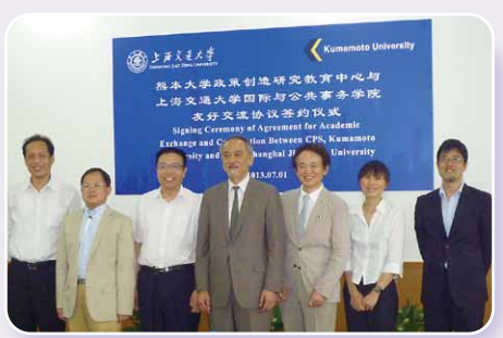
A memorial photo taken after the signing ceremony

2012 to Shanghai Jiao Tong University. It is hoped that the agreement between the universities will lead to even deeper amicable relations in the future.